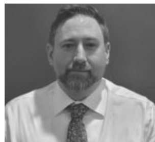
Andrew Wakefield SSHRC