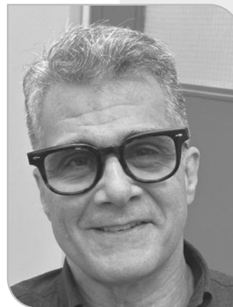
2023 National Conference Chair

CARA delivered 3 conferences this year, the national conference in St. John's, Newfoundland, CARA East in London, Ontario and CARA West, a virtual event. We also hosted a virtual event in honour of Research Administrator Day, bringing together experts from around the world to share their expertise. We gratefully acknowledge the leadership of the conference planning committees and all the speakers at these events, which were attended by 680 delegates.